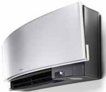
Whisper quiet, down to 19 dB(A)

The two-area intelligent eye sensor controls comfort in two ways. If the room is empty for 20 minutes, it changes the set point to start saving energy. As soon as someone enters the room, it immediately returns to the original setting. The intelligent eye also directs air flow away from people in the room to avoid cold draughts.